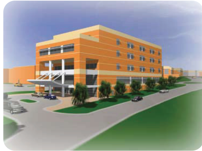
Catawba Valley Medical Center Pavilion